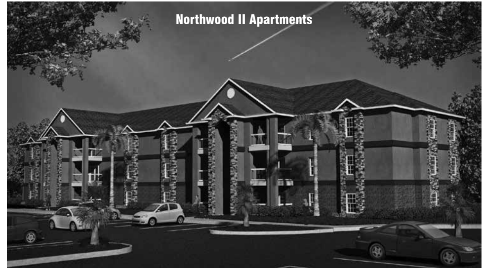
Northwood II Apartments